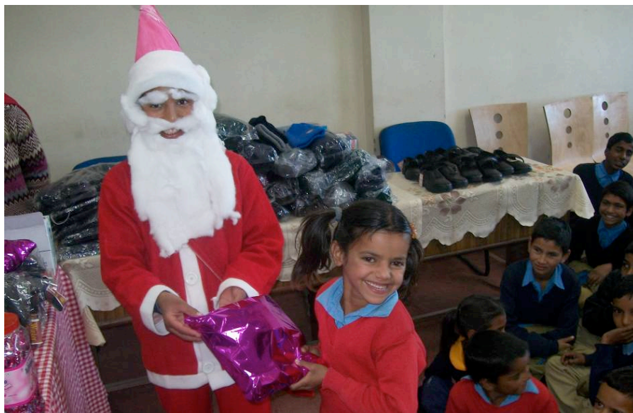
Donk Primary School students joined in the fun for Christmas at Kaplani School and received gifts from Santa – 18/Dec/12